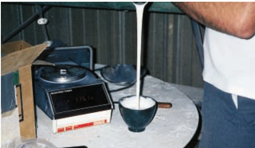
Each formula the binder and refractory manufacturing company mixes has to be tested for pour time, set time, and slump before being approved for packaging.

The company ended up earning frequent driver miles as it hauled its ingredients back and forth to a Wisconsin-based test center, to ensure that it selected a mixer that could meet its rigid mixing requirements.